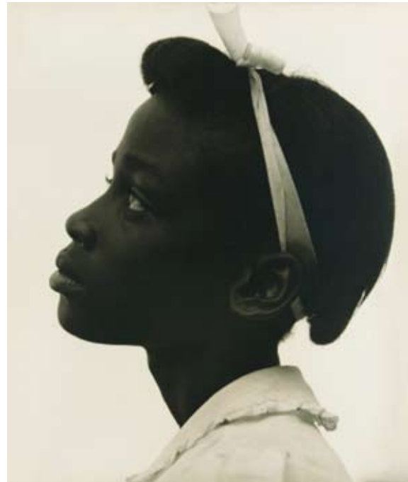
Consuelo Kanaga, American, 1894 - 1978, Young Girl in Profile , 1948 Gelatin silver print, 9.875 x 7.625 in. (25.1 x 19.4 cm.), loan from a private Florida collection, Photographic Formalities: From Ansel Adams to Weegee