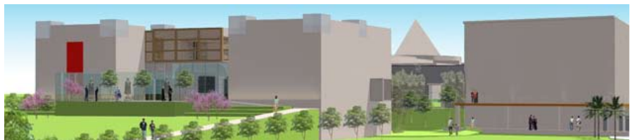
Asian Wing opening 2010