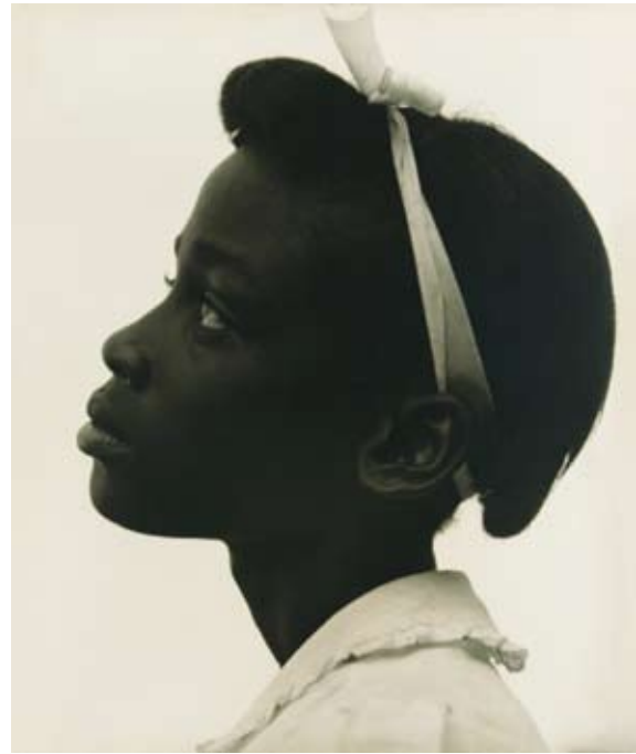
Consuelo Kanaga, American, 1894 - 1978, Young Girl in Profile , 1948 Gelatin silver print, 9.875 x 7.625 in. (25.1 x 19.4 cm.), loan from a private Florida collection, Photographic Formalities: From Ansel Adams to Weegee