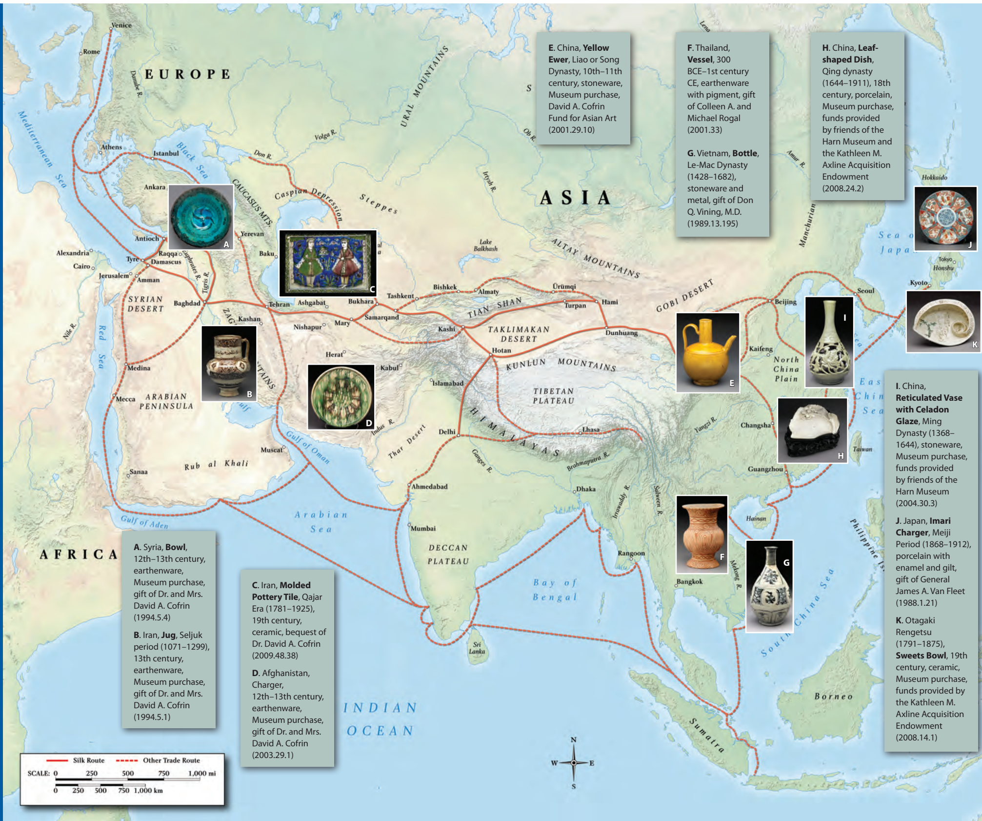
E. China, Yellow Ewer, Liao or Song Dynasty, 10th–11th century, stoneware, Museum purchase, David A. Cofrin Fund for Asian Art (2001.29.10)