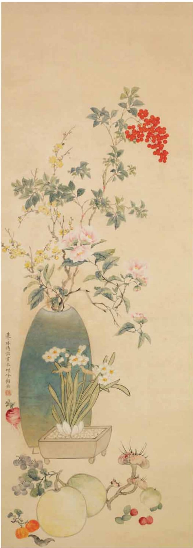
China, Flowers, Fruit, and Vegetables , 1856 Gu Shao (active c. 1810 – 1860), museum purchase, funds provided by the Kathleen M. Axline Acquisition Endowment

Look through the galleries and see if you can find these examples of nature :