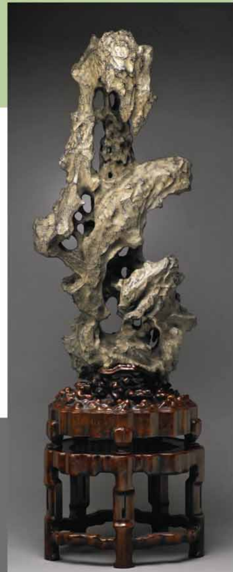
China, Upright Scholar's Rock 19th - 20th century, museum purchase, funds provided by friends of the Harn Museum

Have you ever found a rock that seemed to be shaped like an animal? Or shaped like something you have never seen before?