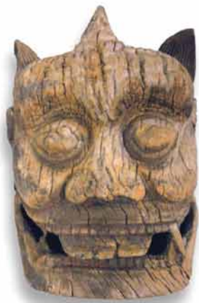
Japan, Guardian Oni Mask 14th century Gift of Kagedo Japanese Art

The Harn Museum took this statue of a Buddhist follower to a hospital to be X-rayed to see what it was made of. The X-rays show us the texture of the wood.