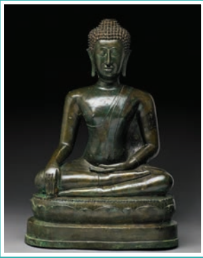
Thailand, Shakyamuni Buddha , 15th–16th century, bronze, Museum purchase, funds provided by the Kathleen M. Axline Acquisition Endowment (1997.11)