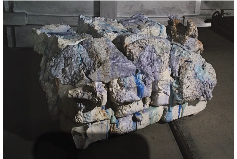
Inspired by Osamu Kojima, Nostalgia 07-01p , 2007.