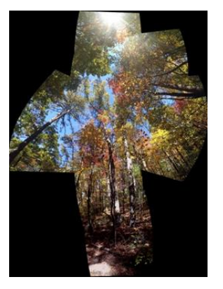
Untitled (Born Again Art Ass) working title 1989 Cibachrome On loan from artist