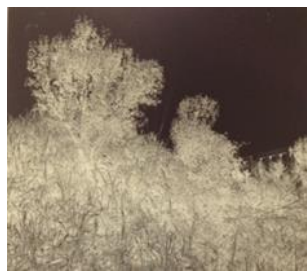
Education is Power , 1968 Combined gelatin silver prints, hand-colored, 16 x 20" On loan from the artist