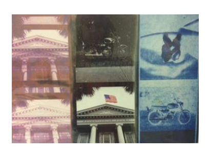
Self Portrait as Robinson & Rejlander , 1964 Combined gelatin silver print, hand-colored, 8 x 10" On loan from the artist