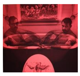
Untitled , 1968 Combined gelatin silver prints, hand-colored, 13-1/2"x9" On loan from the artist