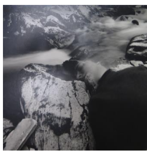
Gilded Landscape, 1995

Gelatin silver print (double exposure), 1973 On loan from the artist