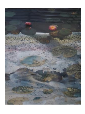
Lake Ravenel II Cibachrome, 1991 On loan from the artist