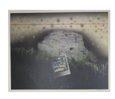
Family Album II Mixed media collage, 1988 On loan from the artist