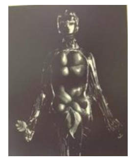
Untitled , 1961 Negative gelatin silver print, 8 x 9", mounted on board On loan from the artist