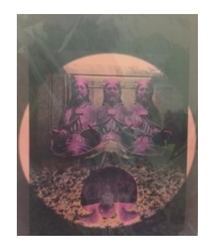
Untitled , 1968 Combined gelatin silver prints, hand-colored, 19-1/4"x15" On loan from the artist