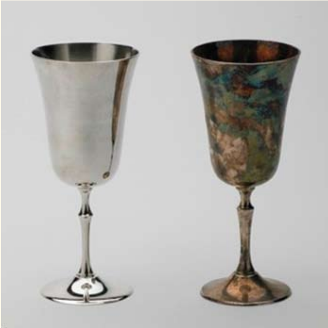
Before and after: Tarnished silver

home tip: It is best to wear clean cotton gloves when handling objects that are most vulnerable to damage. Never use harsh or abrasive chemicals to clean your objects to avoid causing long-term damage. For valuable objects, it is always best to rely on the expertise of a professional conservator.