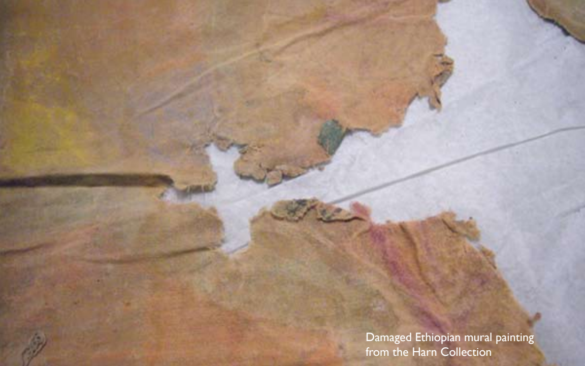
Damaged Ethiopian mural painting from the Harn Collection