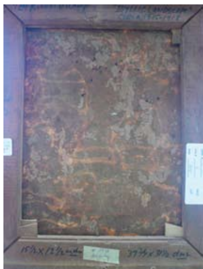
Examples of insect damage on oil on canvas