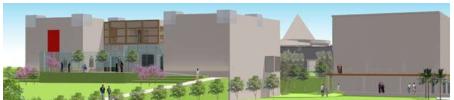
Asian Wing opening 2010