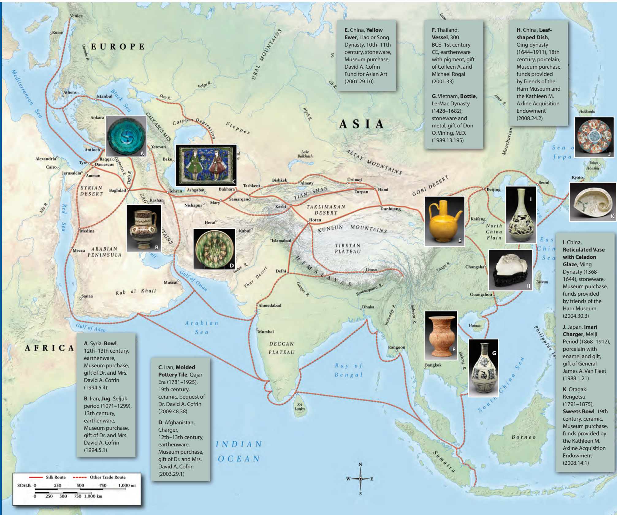
E. China, Yellow Ewer, Liao or Song Dynasty, 10th–11th century, stoneware, Museum purchase, David A. Cofrin Fund for Asian Art (2001.29.10)