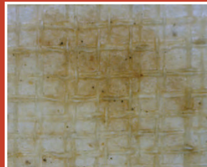
Spot of foxing magnified 60 times

Jang Seung'eop (1843–1897), Scholar in a Garden , Joseon Dynasty (1392–1910), late 19th century, ink and color on silk, gift of General James A. Van Fleet (1988.1.26)