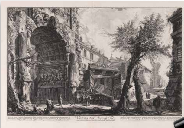
Giovanni Battista Piranesi, Veduta dell'Arco di Tito. Esso fu eretto a questo Imperadore dopo la di lui morte in memoria della distruzione di Gerosolima (View of the Arch of Titus). It Was Erected for this Emperor After His Death in Memory of the Destruction of Jerusalem)

Prints depicting these sights were must-have souvenirs. Italian artist Giovanni Battista Piranesi produced more than 100 etchings in his series Vedute di Roma (Views of Rome). These prints were widely collected by travelers.