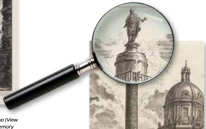
Giovanni Battista Piranesi, (Detail) Colonna Trajana (Trajan's Column)