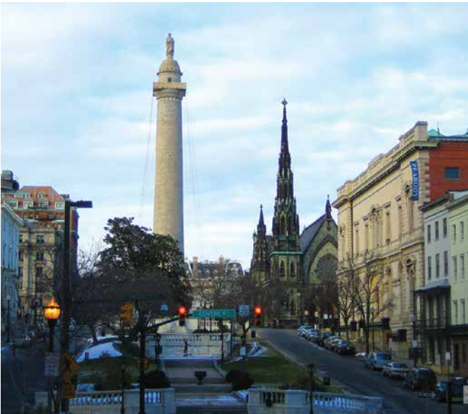
Washington Monument, Baltimore completed in 1829, architect: Robert Mills

Where else in the world have you seen the influence of this Roman architecture?