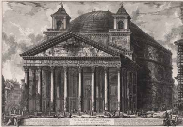
Giovanni Battista Piranesi, Veduta del Pantheon d'Agrippa oggi Chiesa di S. Maria ad Martyre (View of the Pantheon of Agrippa, today Santa Maria ad Martyres [actually the Pantheon of Hadrian])

In the 18th century, wealthy men and women followed the Grand Tour around Europe as part of their cultural education. Ancient ruins and impressive architecture made Rome an important stop on this rite of passage.