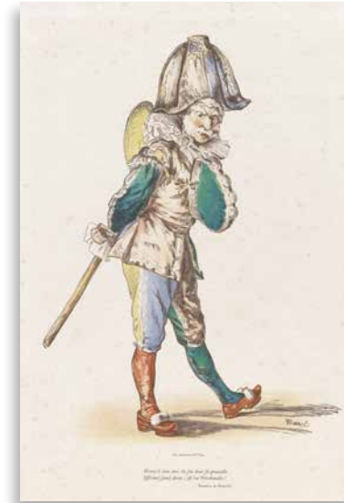
Édouard Manet, Polichinelle

Pulcinella was a character of contradictions who might act as a “know-it-all” but be completely ignorant of the situation. He also tended to have a hot temper and acted with deceit, self-interest and vulgarity.