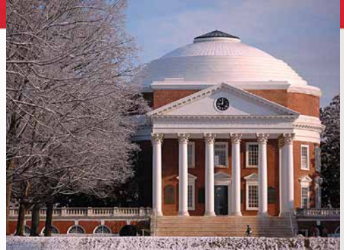
The Rotunda at the University of Virginia completed in 1826, architect: Thomas Jefferson