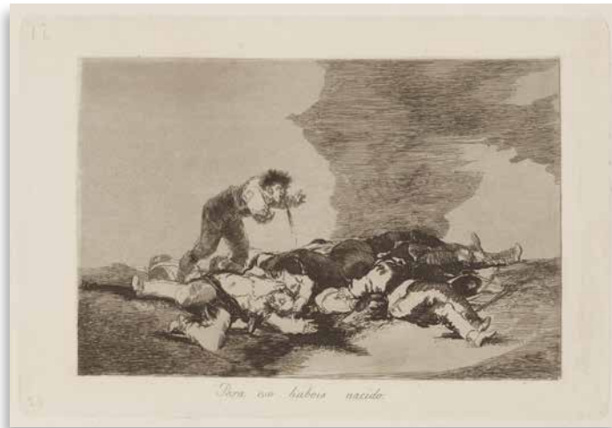
Francisco Goya, Para eso habeis nacido (This Is What You Were Born For)

What do you think Goya was criticizing about war?