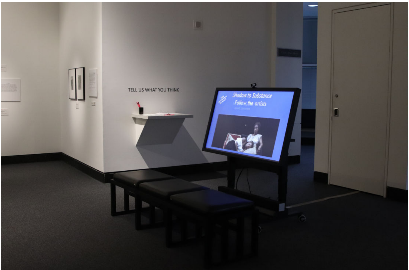
Touchable installed in Shadow to Substance .