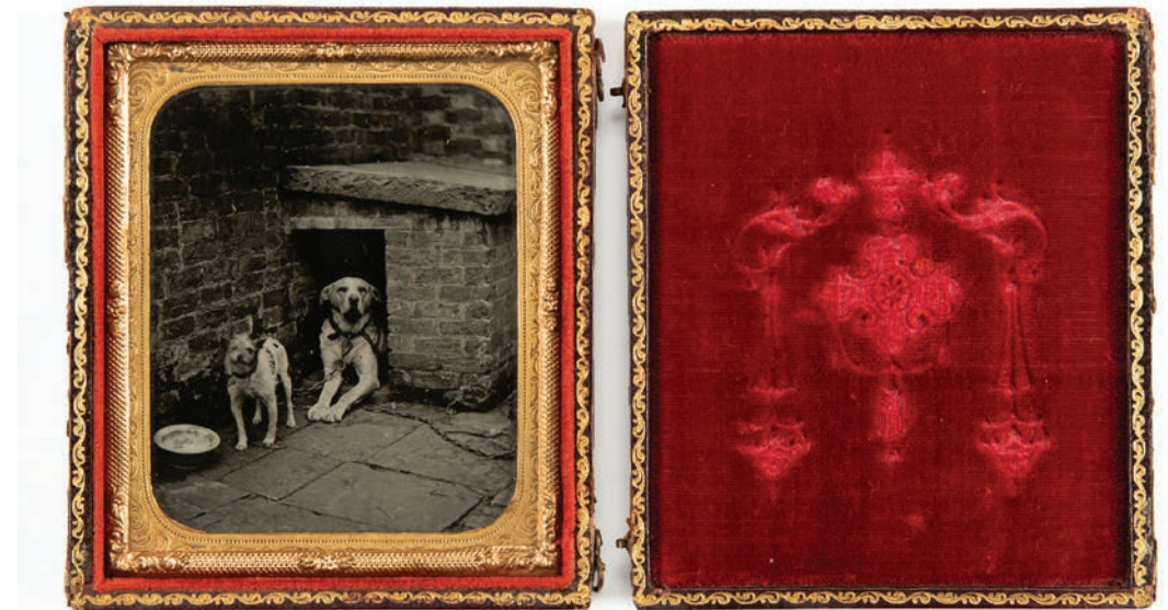
images: (page 7) Douglas Prince, Man Planting Landscape , 1992, Gift of Doug Prince; (page 8) Artist unknown Untitled (two dogs by a brick kennel with a feeding bowl and chains) , 1860s, Museum purchase, funds provided by The David A. Cofrin Acquisition Endowment; (page 9) Elliott Erwitt, Reno 1960 , 1960, Gift of James W. Hall

Art occupies a unique space in all our lives. It rouses memories and curiosities about people, histories, livelihoods, spiritual longings, injustices, travel and more. With Windows and Mirrors , the staff makes these enquiries visible and resonant. The result is a fascinating, revealing survey of the Harn's awesome workforce, many of whom are also artists, musicians, scholars, activists, mothers/fathers, partners, animal lovers and seekers. You will experience images and texts that are moving, truthful, sometimes critical, but most importantly, a perfect declaration of who art is for—each and every one of us.