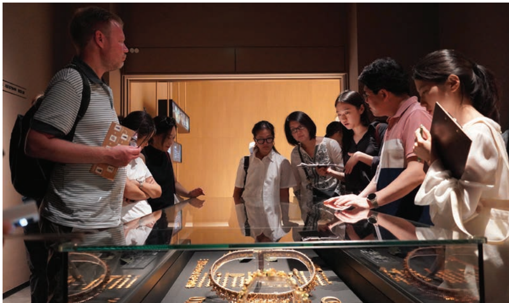
images: (left) Visiting Gyeongju National Museum; (page 12) Visiting Jjoksaem Excavation Site

Over the course of ten days, we visited a total of 21 institutions including Gyeongju National Museum, the National Museum of Modern and Contemporary Art, Leeum Samsung Museum of Art and the Korea University Art Museum. Tours of archeological sites in the Daereungwon Ancient Tombs District, cultural and research institutions in both Seoul and Gyeongju, as well as historical landmarks such as Gyeongbokgung Palace were a highlight of the trip. During these visits, program participants engaged with curators, educators, conservators, archaeologists,