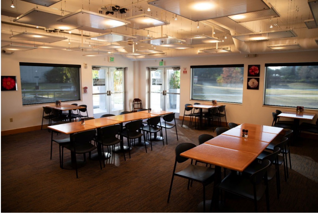
Camellia Court Café

The Camellia Court Café offers delicious sandwiches, salads, and soups. Locally brewed Opus coffee, wine, beer, and freshly baked sweets are also available. They are also now accepting mobile orders through the Transact Mobile Ordering App. You can find their menus on our website or inside the café. You can sit wherever you feel most comfortable in the café and order from the counter. The café staff are happy to help you with anything you may need.