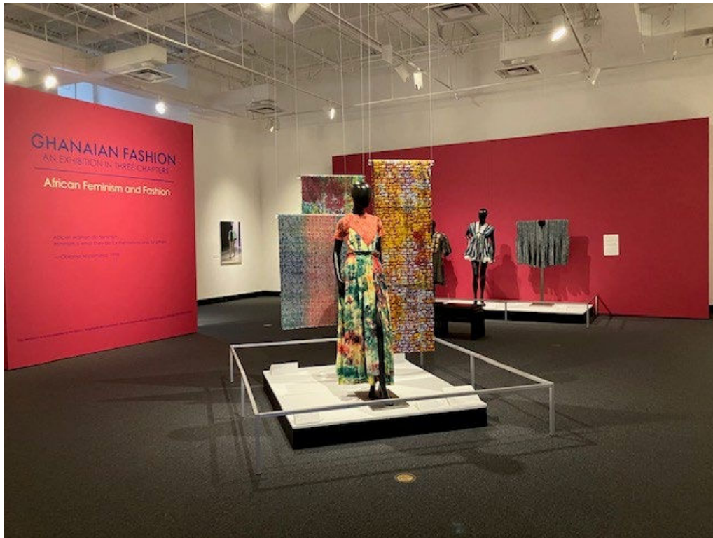
African Art Gallery