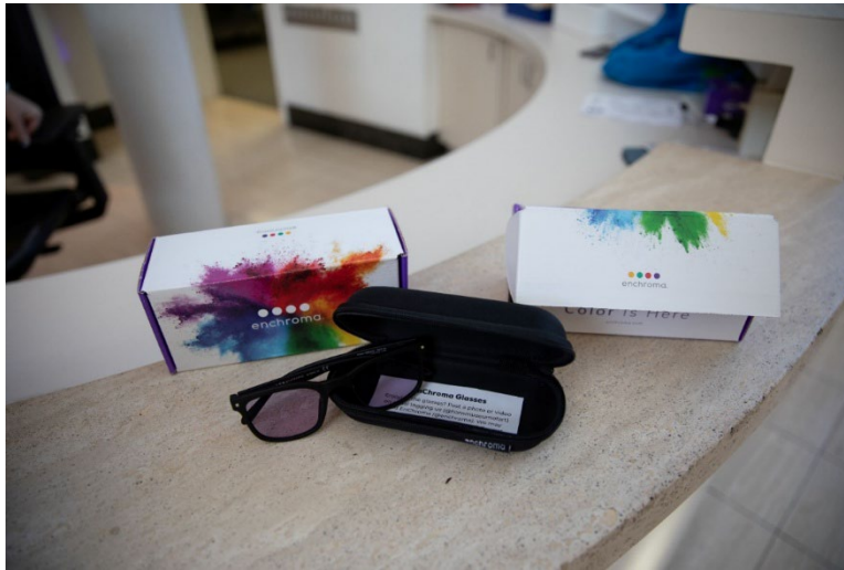
EnChroma Color Blind Glasses

To ensure everyone can enjoy the beauty of the art at the Harn, we offer EnChroma Color Blind Glasses for visitors to check out at our Visitor Services desk. These glasses are available for both children and adults.