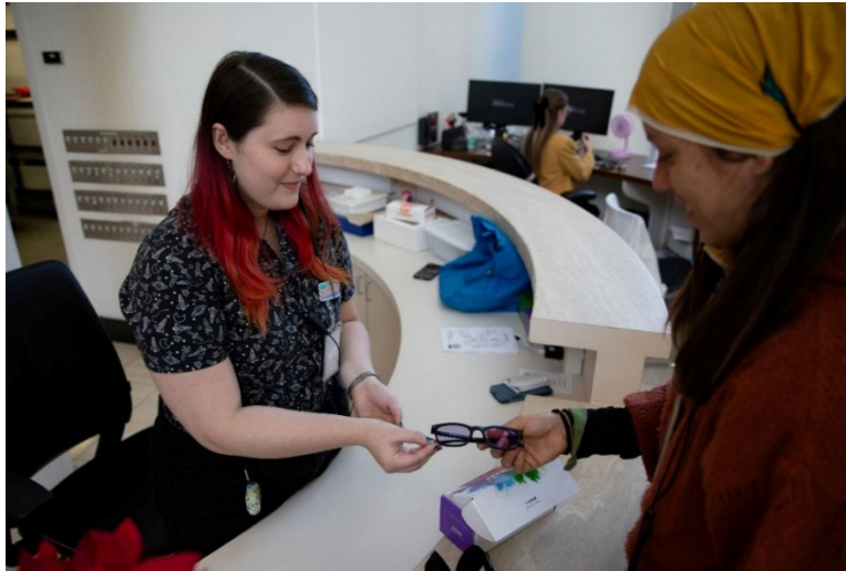
Receiving EnChroma Color Blind Glasses