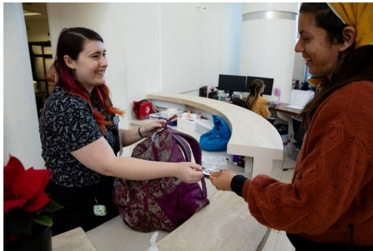
Receiving Tag Number for Checked Items

If you have a backpack, umbrella, water bottle, food, or drinks, you will be directed to the Security Desk. These items are not allowed in the Galleries. Everyone checks in their belongings to keep the art safe. The Security Guard will give you a numbered tag and safely store your items while visiting the Museum. You can return to the desk at any time to retrieve your belongings. You will pick them up when you leave for the day.