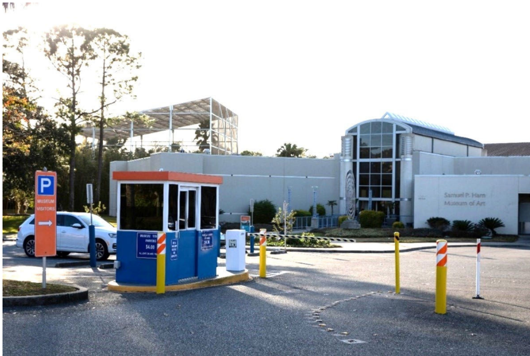
Museum Parking Kiosk

If you wish to use the visitor parking lot, drive to the kiosk with a gate to pay for parking. Visitor parking is $4 (credit card only) on weekdays. If you have a handicapped parking permit, there are free handicap spots to the left of the kiosk in front of the museum. If you have a UF Decal, you can park in the larger lot for free. Parking in the evenings and at weekends is also free.