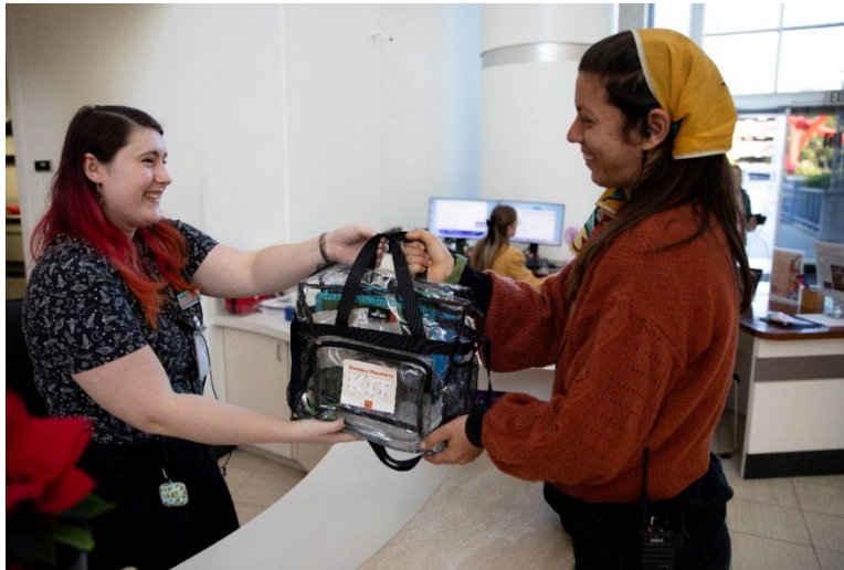
Receiving a Sensory Kit