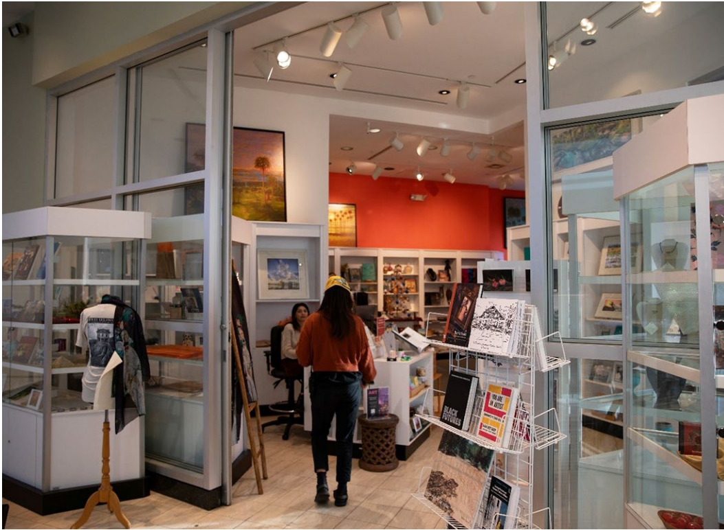
Museum Gift Shop

There is a Museum Store on the south side of the Galleria, where you can explore things you can purchase. The store clerk will greet you when you enter. They are happy to see you and answer any questions you have.