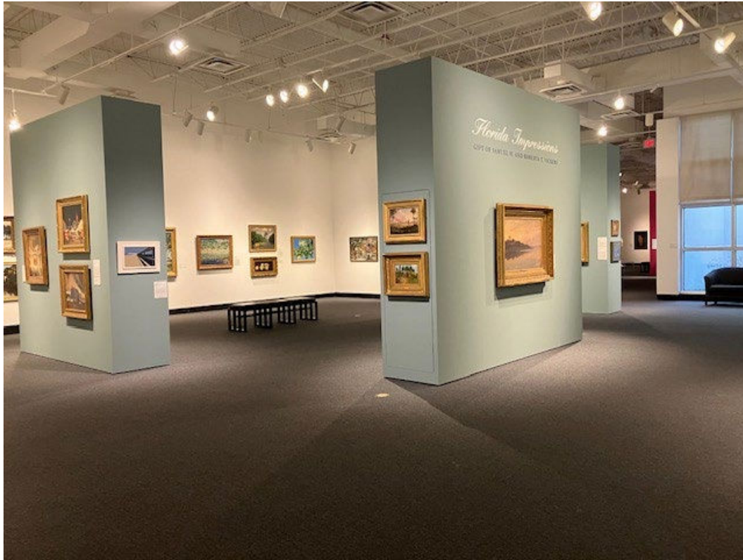
Florida Impressions Gallery