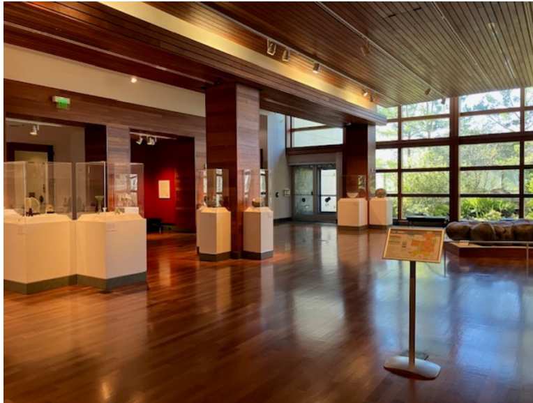
Asian Art Galleries