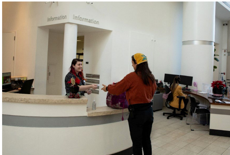
Checking Bag at the Security Desk