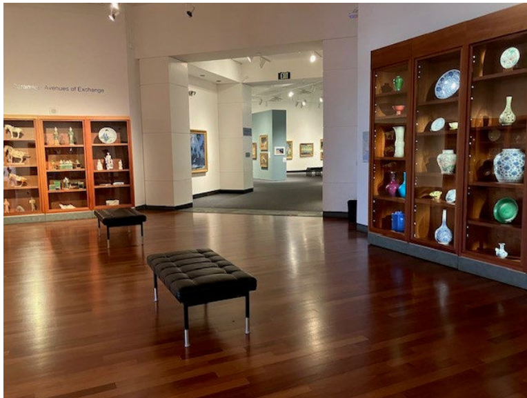
Asian Art Galleries – Ceramics