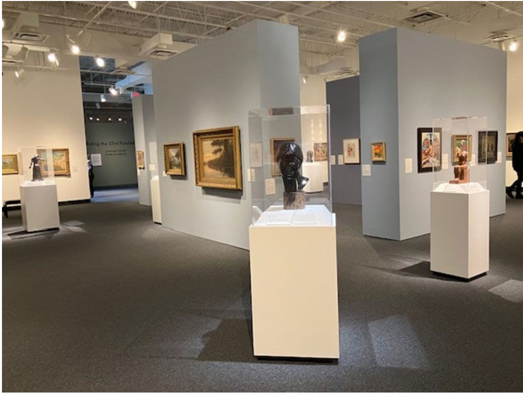
Modern Art Gallery