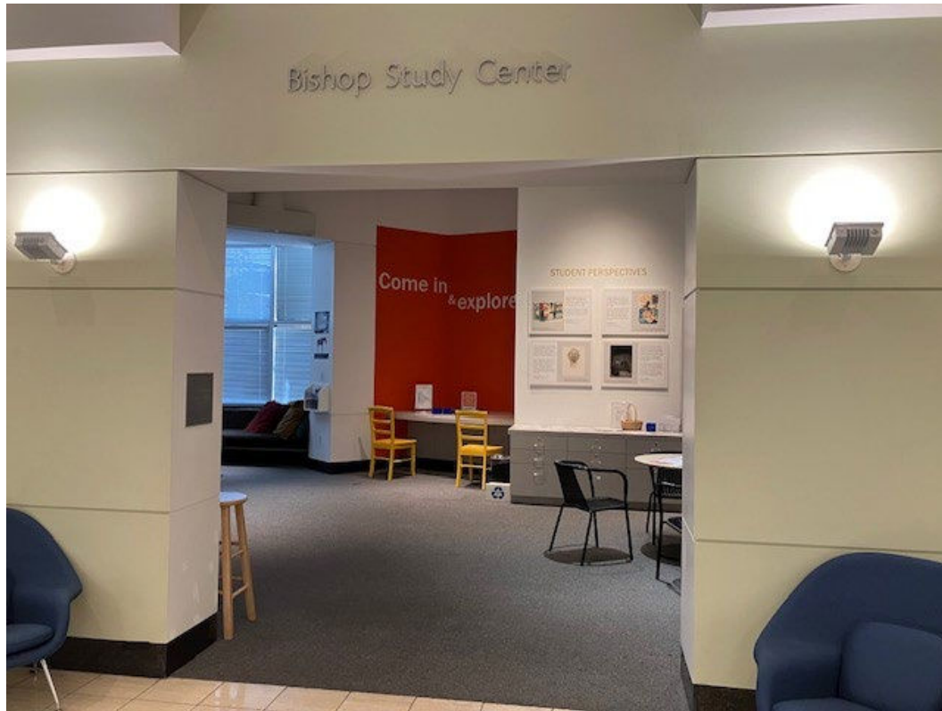
Bishop Study Center

You can walk to the Bishop Study Center if you want something to touch or feel. There are games, books, and pillows in this area.