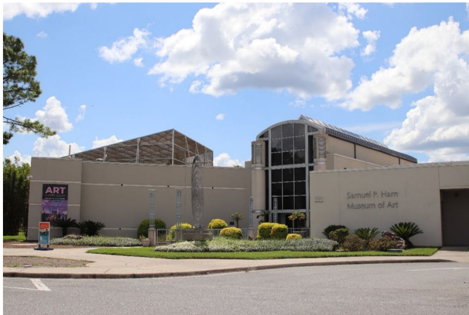
View of the Museum from the Visitor Parking Lot

After you park, you will walk towards the front of the museum. Depending on the current exhibition, there may be different pictures on the museum's glass.